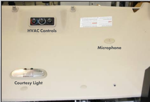
End of line check to verify installed components and wire harness are functioning properly