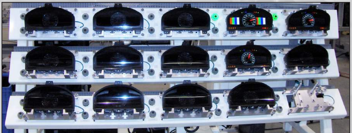
Burn in and final check station to test program and verify proper assembly of part