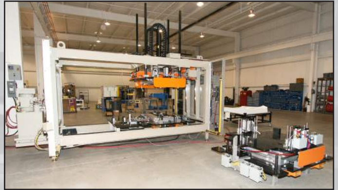
Koops edgefold press with interchangeable tool pack