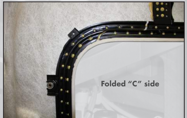
Folded "C" side