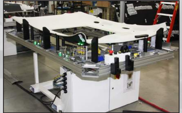
Manual assembly station