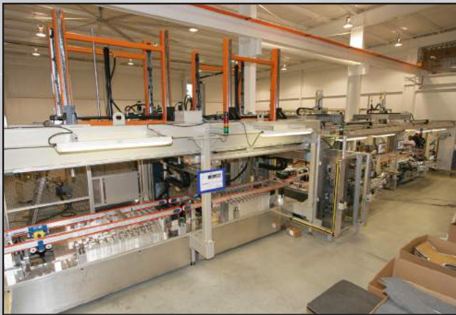
Fully automated overhead system line