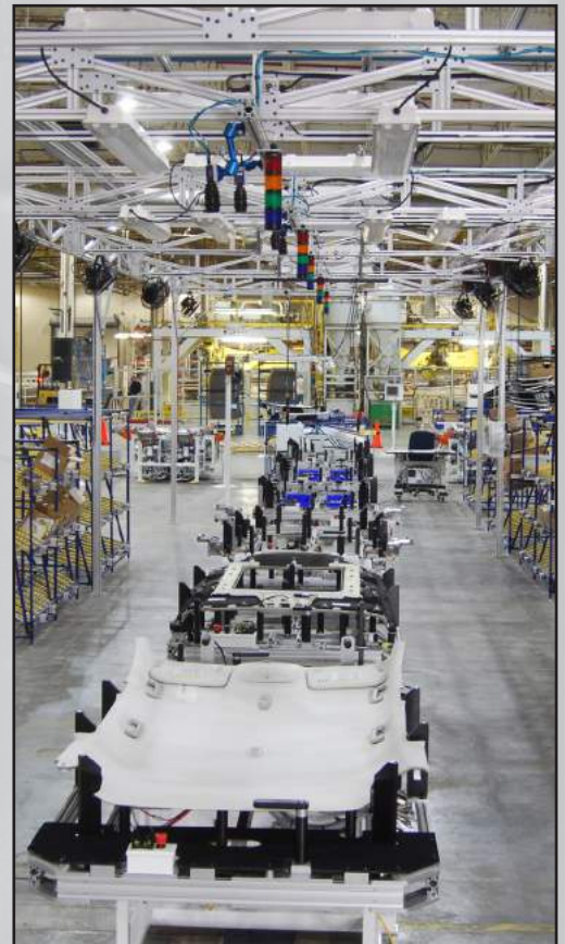
Headliner assembly line with overhead station