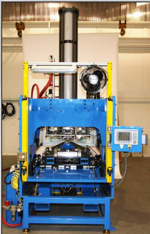
Rivet joining system