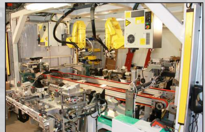
Adhesive dispensing/joining system